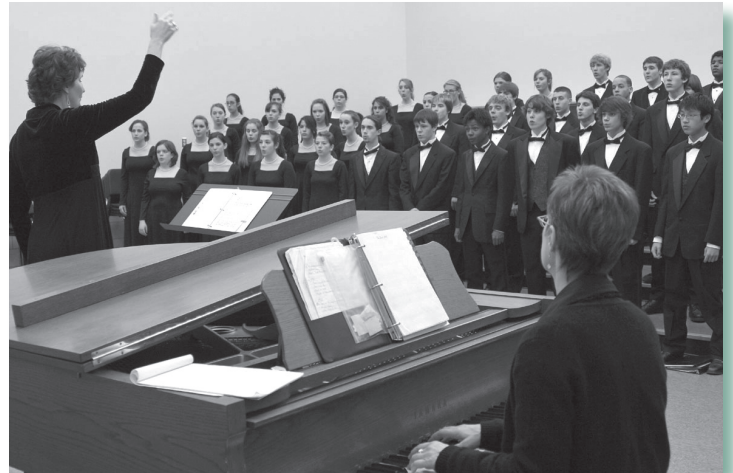
R-H Singers, a choir from the Senior High School, is heading to Carnegie Hall.