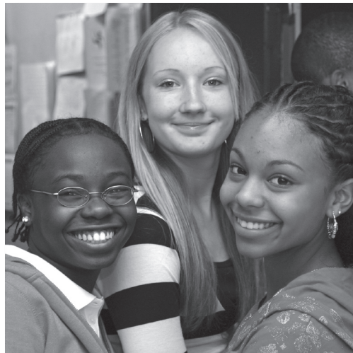
Rush-Henrietta is celebrating measurable academic growth among students.

In 2007, 94 percent of students passed the U.S. History and Government exam, which is the highest passing percentage the district has achieved in the past three years.