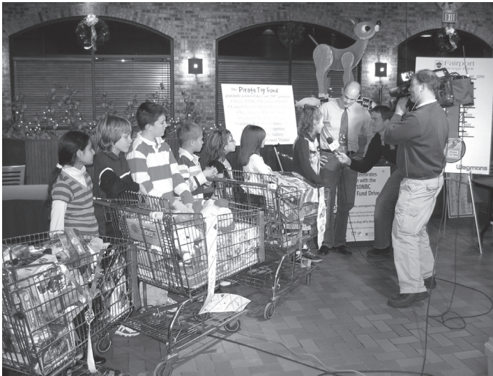
Members of Fyle Elementary School's student council delivered more than 150 items to Wegmans Food Markets to support the Pirate Toy Fund.

The Rush-Henrietta Central School District strives to instill in each student a sense of good citizenship. In December, each school engaged in multiple service projects, and we'd like to share an example from each building.