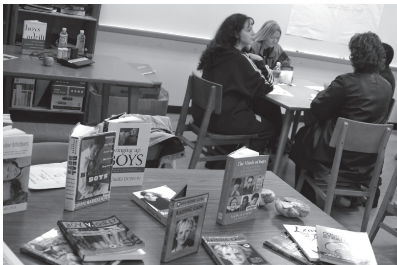
This Parent University workshop focused on the academic achievement of boys.