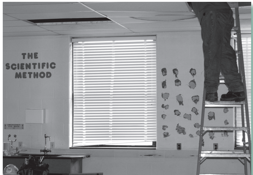
This past summer, several classrooms were renovated at Roth Middle School. Improvements will continue to be made to the school throughout much of 2008.