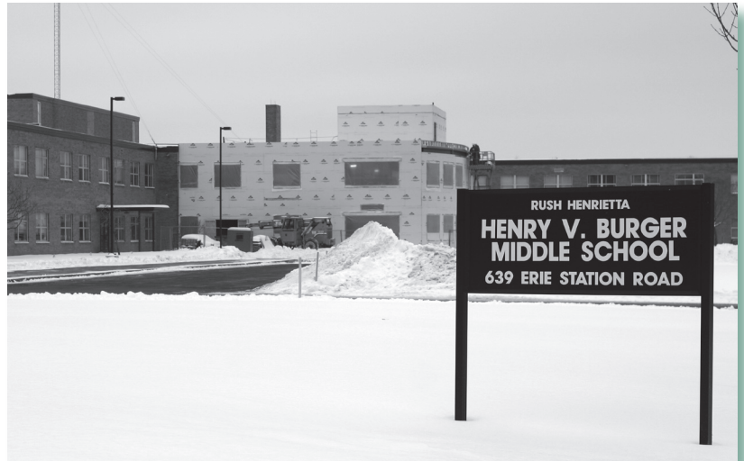
A new addition near the existing bus loop is one of the many enhancements taking place at Burger Middle School. Rush-Henrietta voters approved the work in December 2005.

Updates regarding the district's improvement